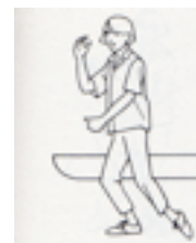
Lion Plays with a Ball