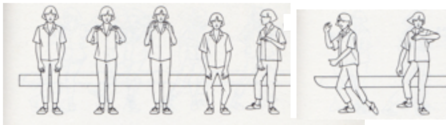
Wu Ji posture